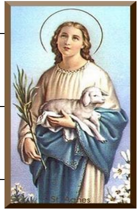
Saint Agnes, Virgin and Martyr January 21