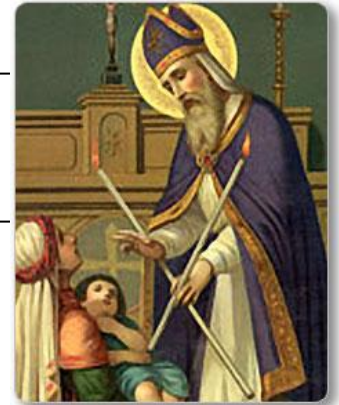
Saint Blaise, Bishop and Martyr February 3