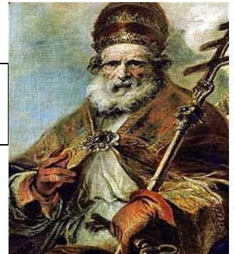
Saint Leo the Great November 10