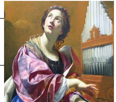
Saint Cecilia, Martyr November 22

Please notify the parish office when you or relatives are admitted to Jefferson Regional Medical Center. Thank you! WE CARE!!