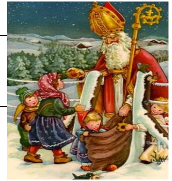
Saint Nicholas December 6

Please notify the parish office when you or relatives are admitted to Jefferson Regional Medical Center. Thank you! WE CARE!!