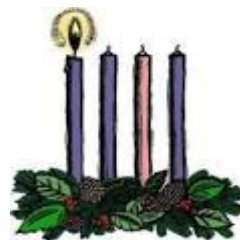
First Sunday in Advent