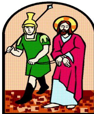
THE FIRST STATION Jesus is condemned to die.

Bring all your friends and the entire family. Afterwards, enjoy the best fish around in Gallagher Hall.