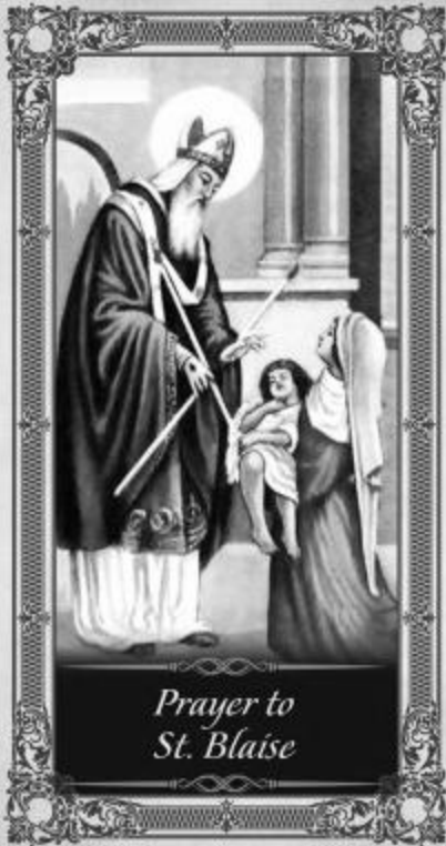
Prayer to St. Blaise